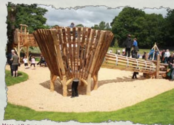
Moss o' Balloch Play Area