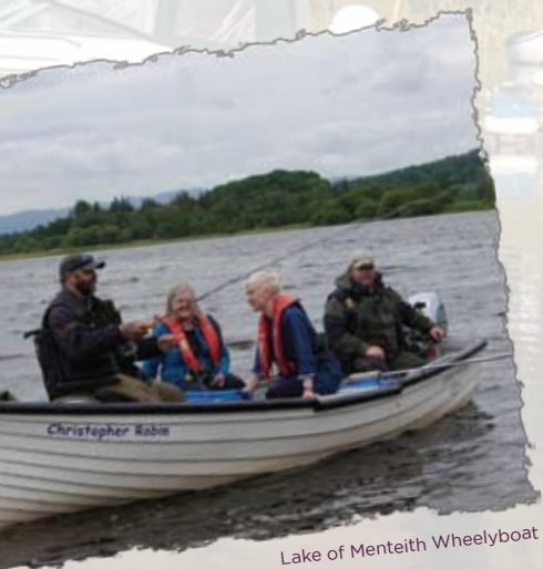
Lake of Menteith Wheelyboat