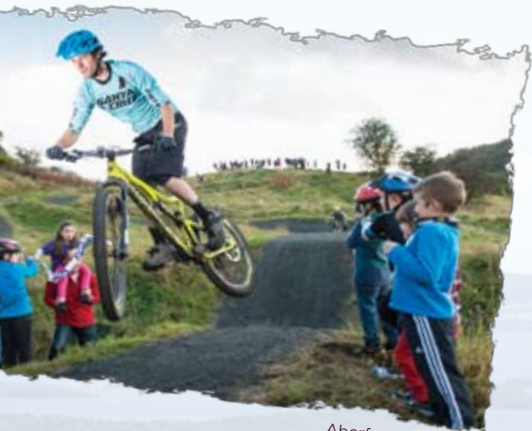
Aberfoyle Bike Park