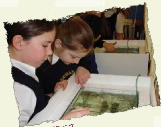
Powan in the Classroom