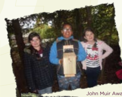
John Muir Awards