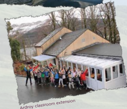
Ardroy classroom extension