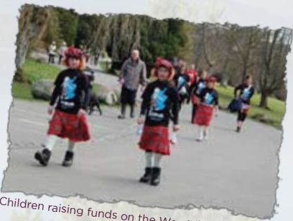
Children raising funds on the Wee KiltWalk