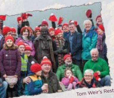
Tom Weir's Rest