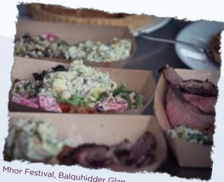
Mhor Festival, Balquhiddar Glen

The Friends of OUR park scheme has helped support a number of community projects celebrating and promoting local cultural heritage as well as projects that have enhanced 'the sense of place' through environmental improvements.