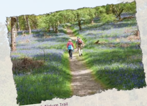
Inchcailloch Nature Trail

Rob Roy Way - The scheme funded improved waymarking along this 79 mile walking route, which starts in Drymen and meanders north through the scenic Trossachs via Aberfoyle and Callander before heading into Highland Perthshire via Strathyre, Lochearnhead, Killin and Aberfeldy before ending at Pitlochry.