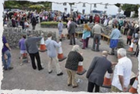
Celebrating Callander Friendship Garden opening