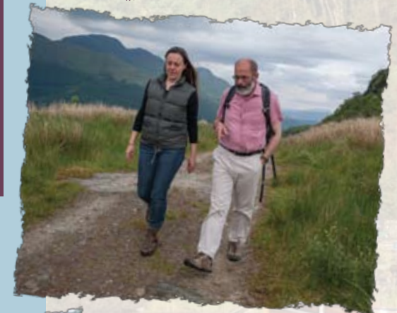
Three Lochs Way

“ I am particularly pleased the first wave of funding raised by our guests is being used to improve and promote the Three Lochs Way path network, as this will open up previously undiscovered parts of the area for the enjoyment of many future visitors as well as local residents in nearby towns and villages. ”