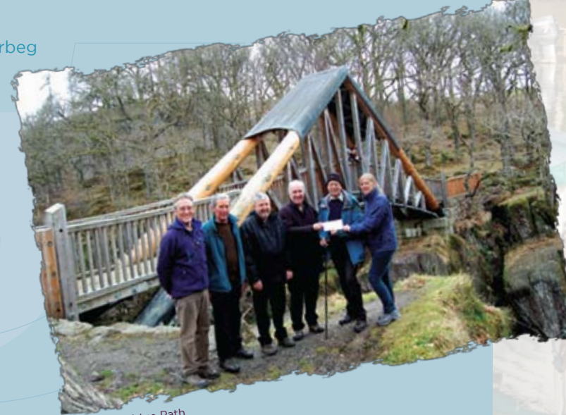
Bracklinn Bridge Path