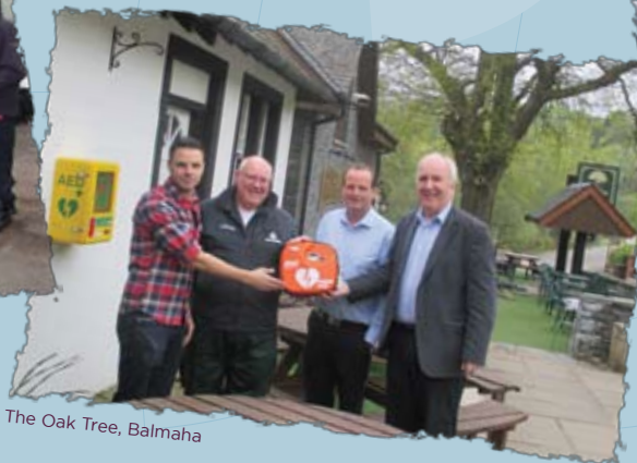
The Oak Tree, Balmaha