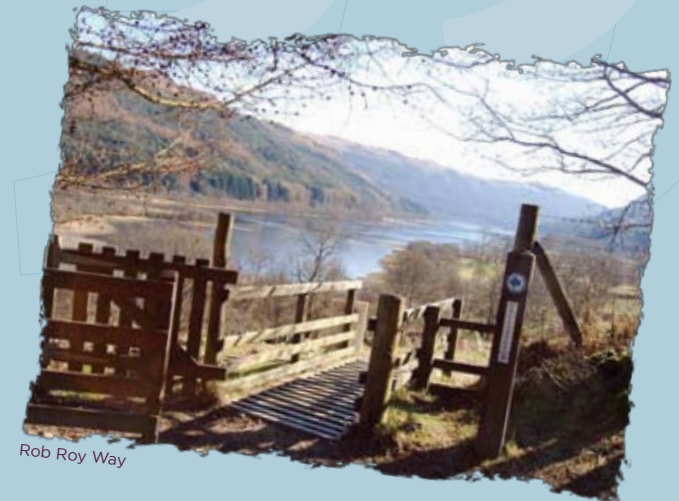
Rob Roy Way